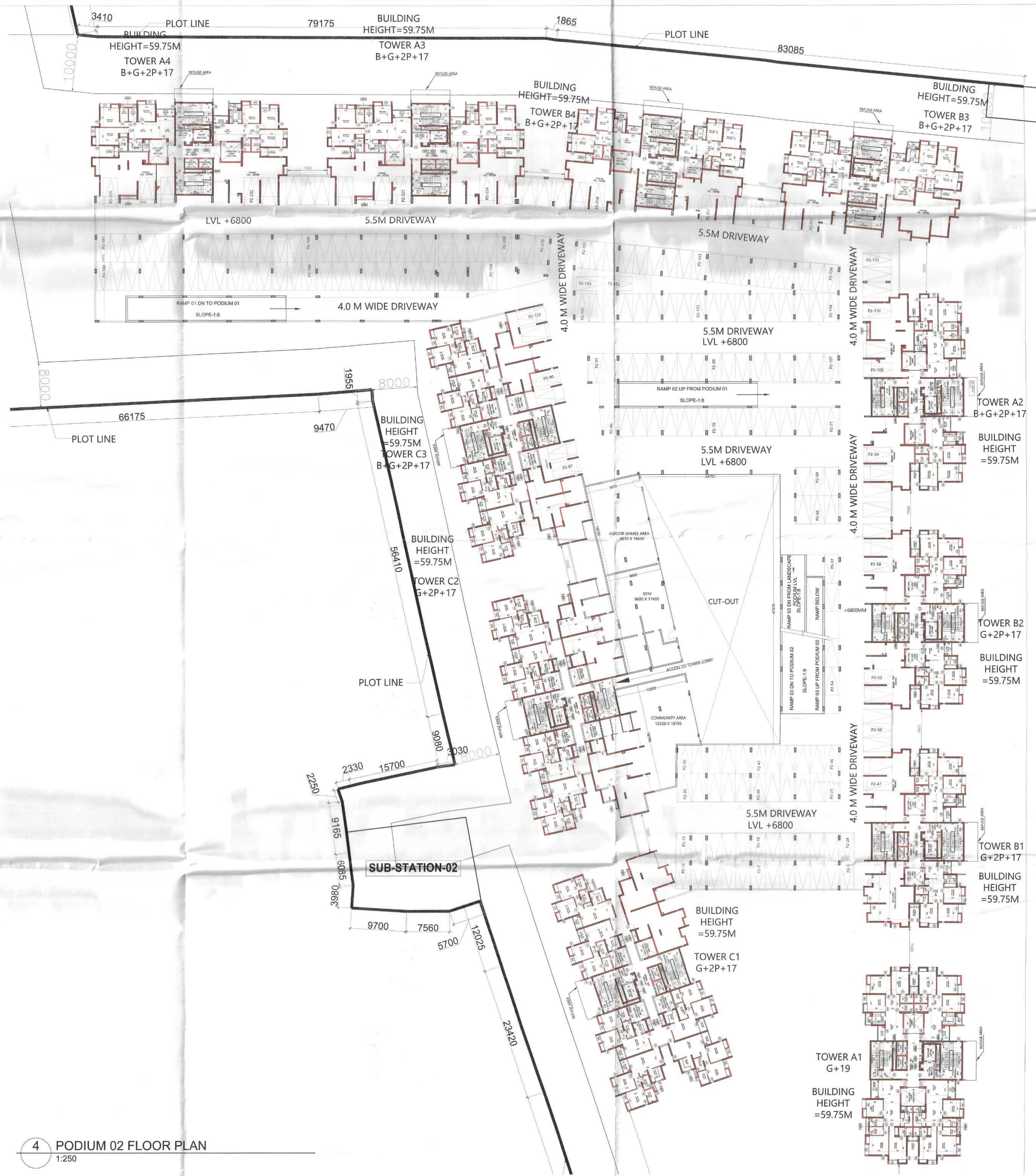
4 PODIUM 02 FLOOR PLAN 1:250

NOTES: • ALL DIMENSIONS ARE IN MM UNLESS IT IS MENTIONED. • FIRE-FIGHTING / SAFETY PROVISIONS WILL BE AS PER RELEVANT NBC PROVISIONS. • COVERING SLAB OF RESERVOIRS, FIRE TENDER PATH SHALL BE STRUCTURALLY SAFE FOR TAKING LOAD OF HEAVY VEHICLES LIKE FIRE TENDER. • ALL BUILDING WILL BE DESIGNED (STRUCTURES) AS PER RELEVANT I.S. CODES FOR EARTHQUAKE RESISTANCE. • PLEASE NOTE THAT THE DIMENSIONS IN THE DRAWINGS ARE TO BE READ, NOT MEASURED.